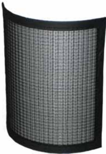
FLEXIBLE VINYL EDGED